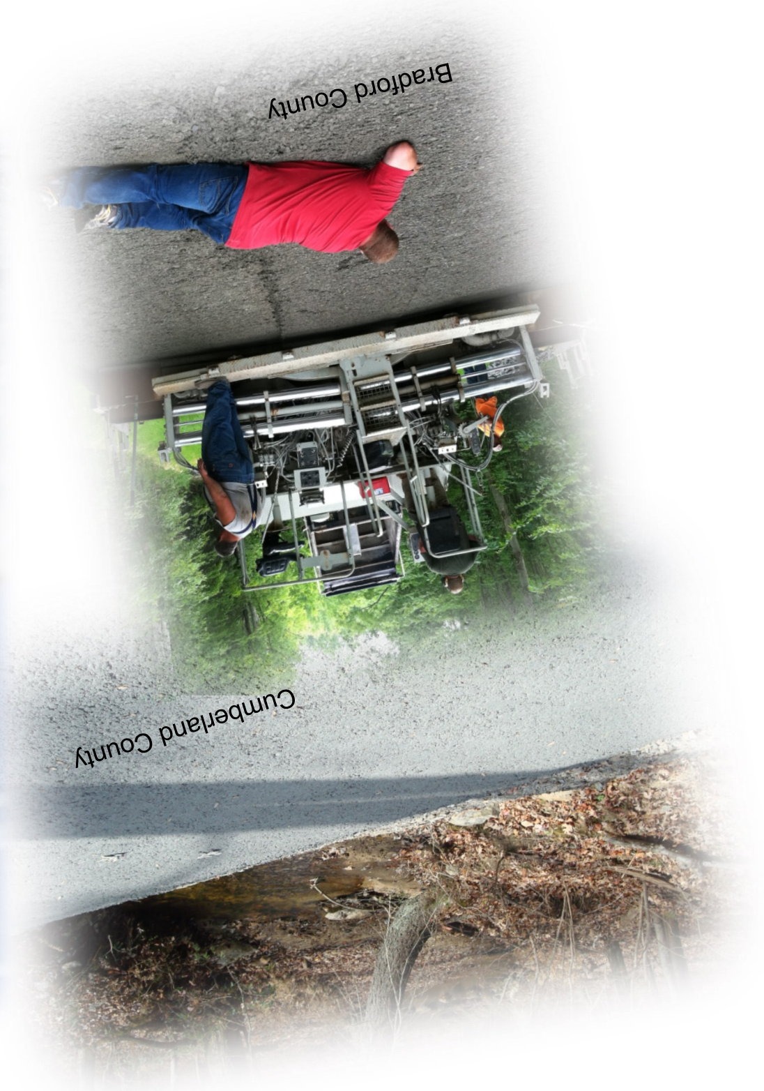
Driving Surface Aggregate