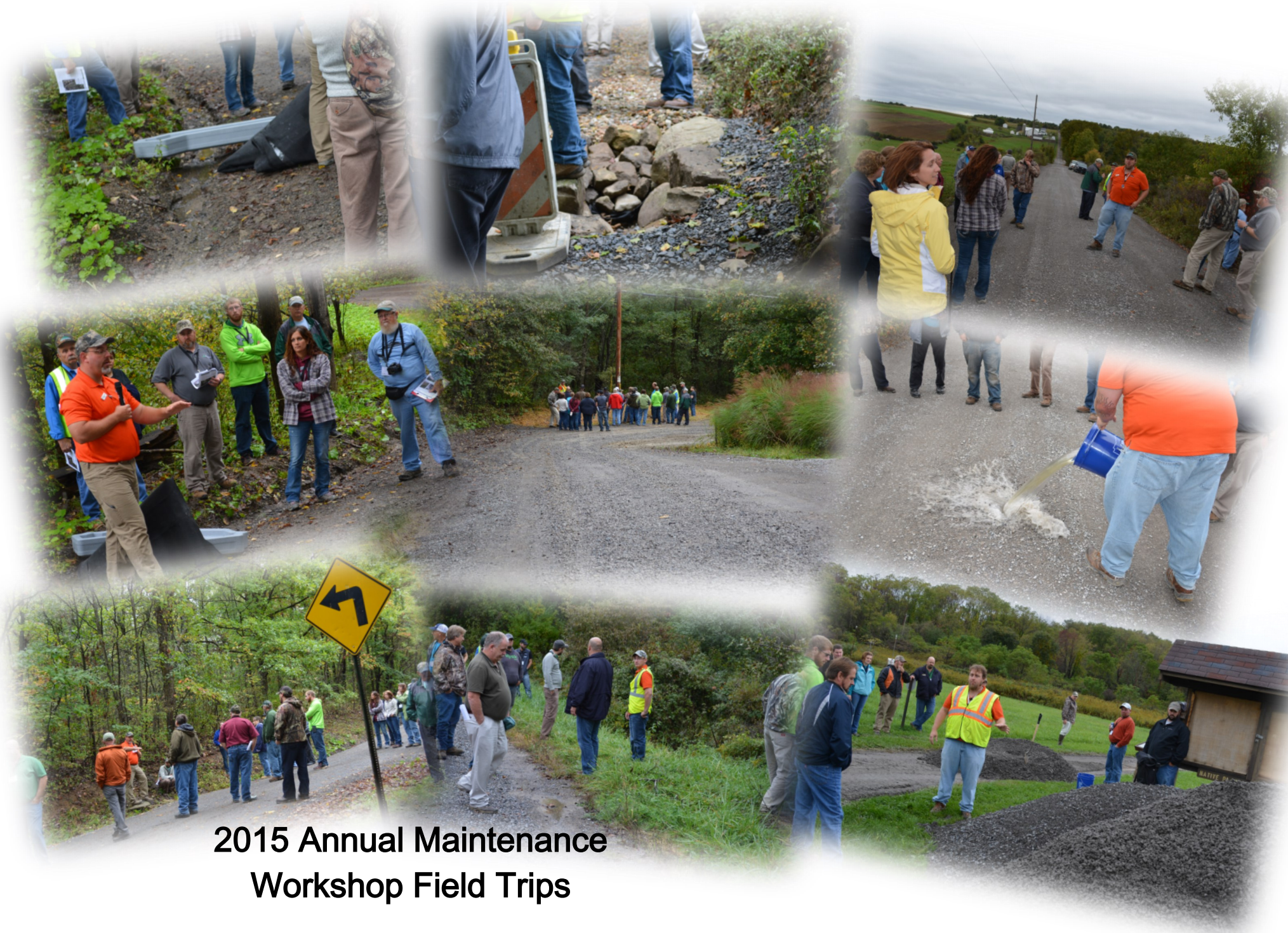
2015 Annual Maintenance Workshop Field Trips