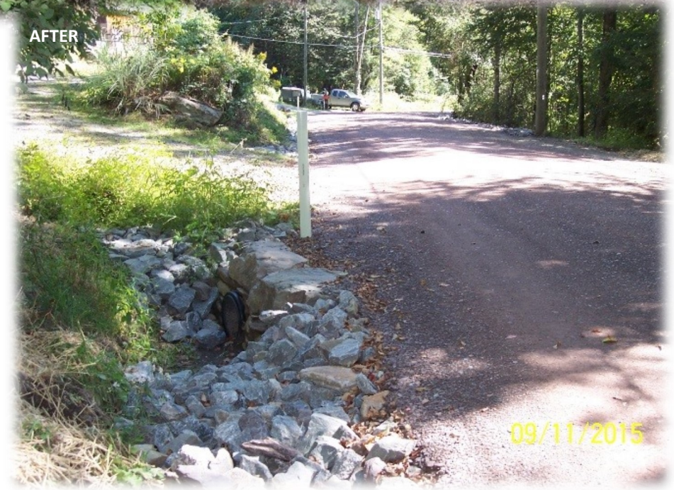
Goodrich Road ~ Dallas Township ~ Luzerne County