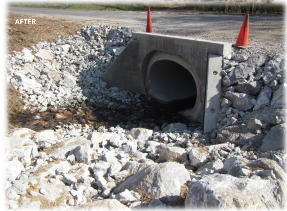
Mill Street ~ Fawn Township ~ York County