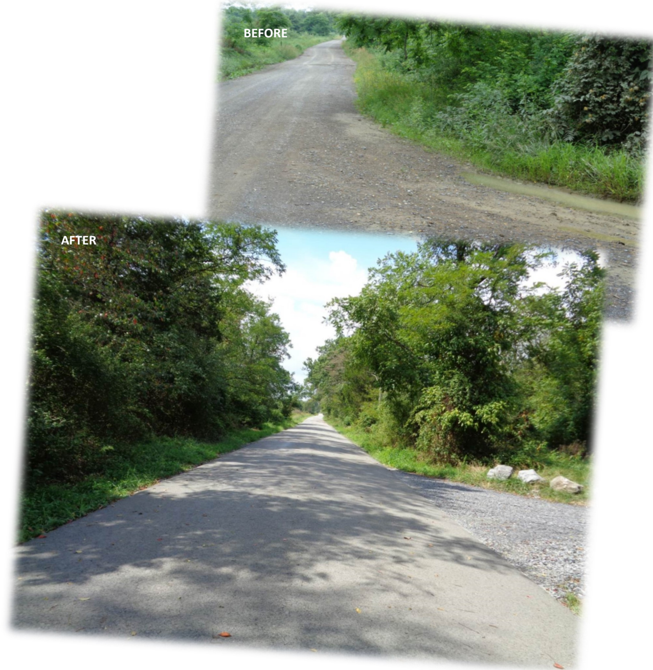
Bridgewater Road ~ Upper Mifflin Township ~ Cumberland County