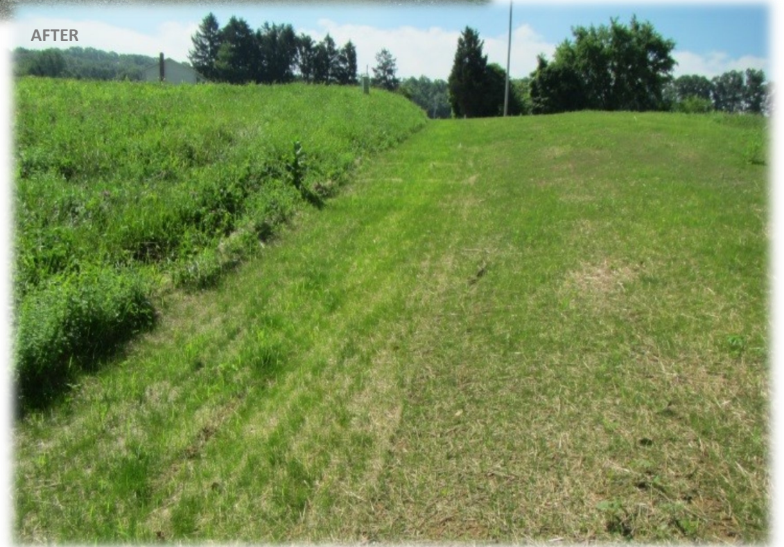
Stambaugh Road ~ North Codorus Township ~ York County