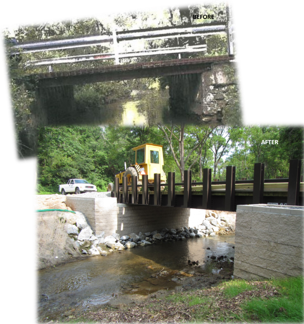
Cherry Street ~ North Hopewell Township ~ York County