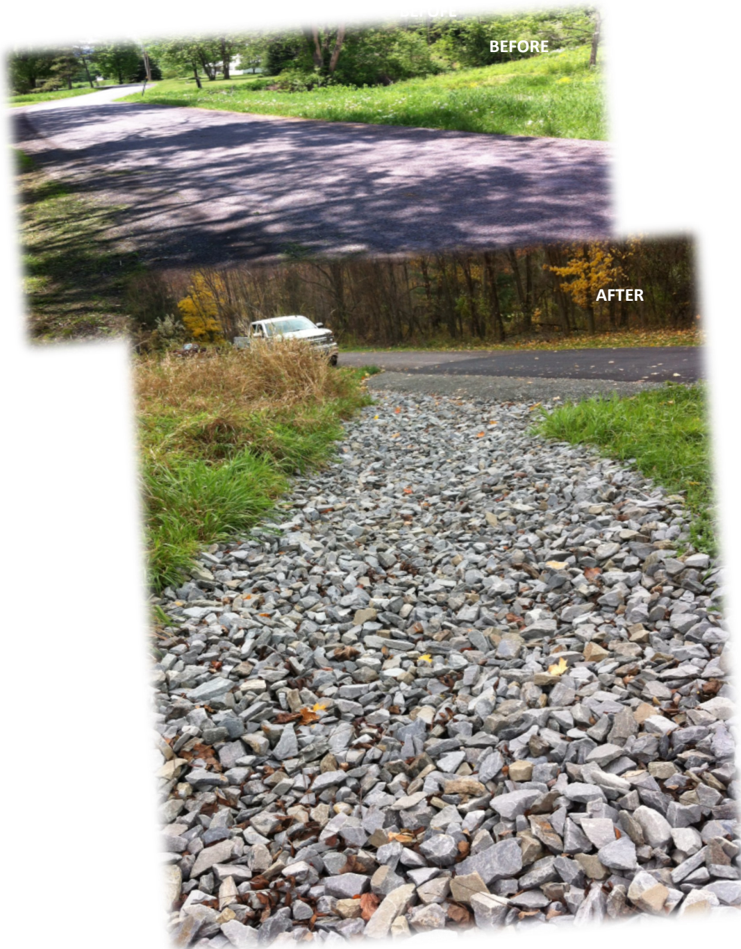
Bowman Road ~ Forkston Township ~ Wyoming County