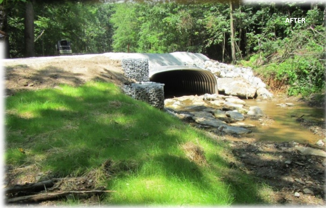
Fake Road ~ Chanceford Township ~ York County