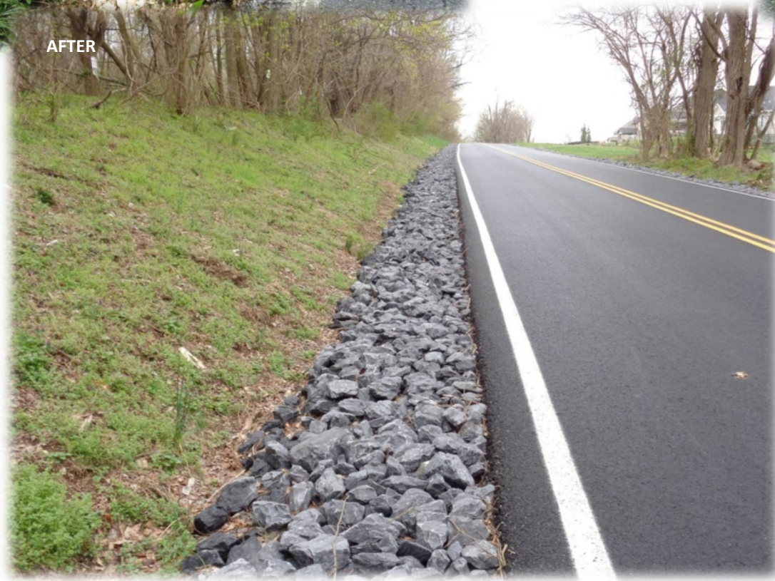
Sears Run Road ~ Hampden Township ~ Cumberland County