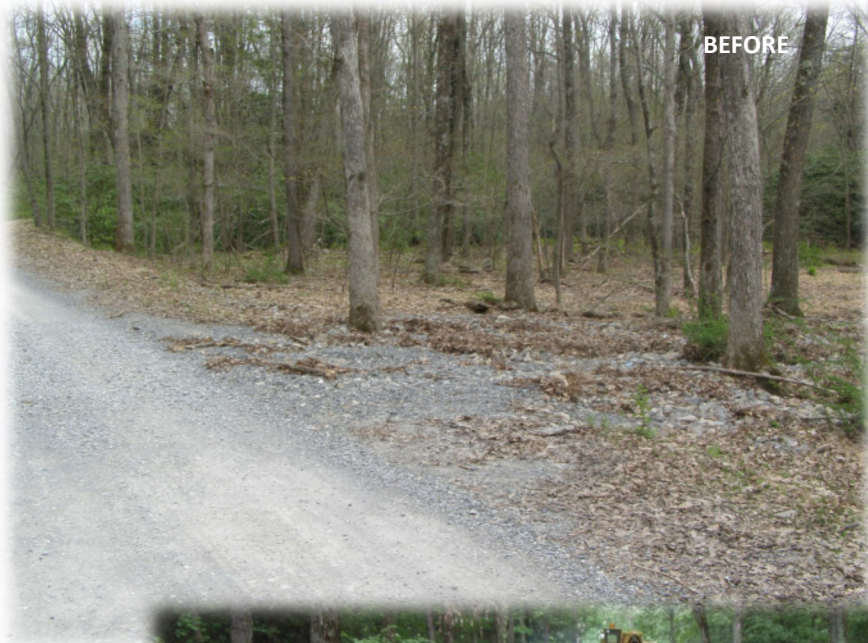
Hell Hollow Road ~ Polk Township ~ Monroe County