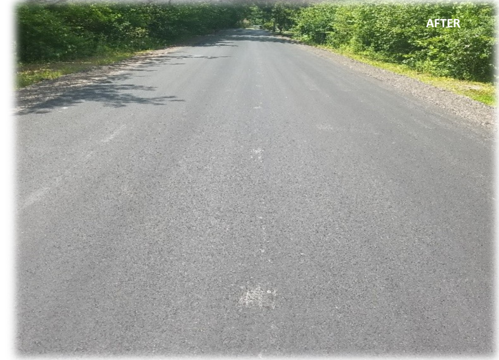
Liberty Street ~ Fairview Township ~ Luzerne County