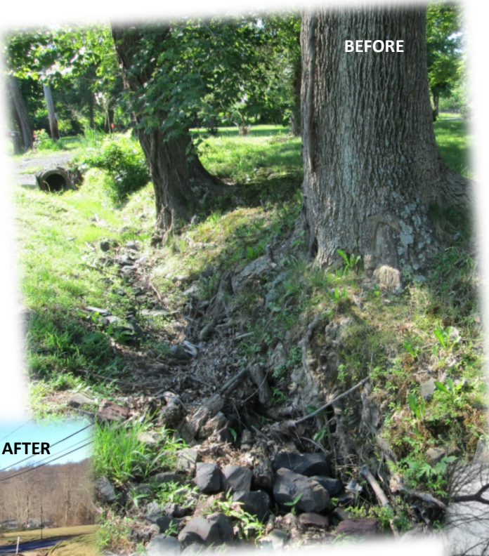
North Dietz Mill Road ~ Salford Township ~ Montgomery County