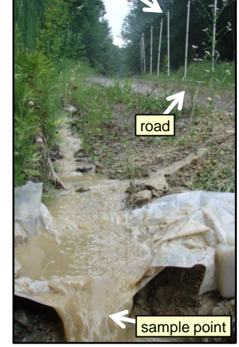
Rainfall simulator running on site C in the Allegheny National Forest.

The publishers of this publication gratefully acknowledge the financial support of the US Department of Energy and the US Forest Service. For additional information, contact: Center for Dirt & Gravel Roads Studies, Penn State University, 215 Transportation Research Building, University Park, PA 16802 (Toll-Free Phone: 1-866-668-6683, Fax: 814-863-6787, Email: dirtandgravel@psu.edu). Additional copies available on our website at: www.dirtandgravelroads.org