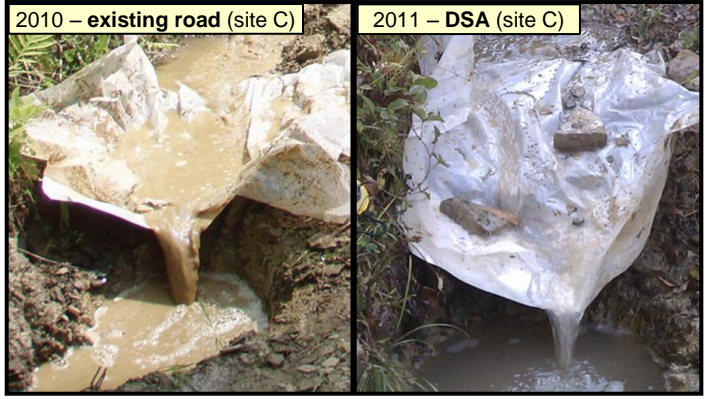
The runoff collection point from site "C" is show here for both the "existing" road in 2010, and after DSA placement in 2011 showing a 95% sediment reduction.

Average sediment production per road-mile by road type. Note the number of test sites available for use in averages varies from 1 to 13.